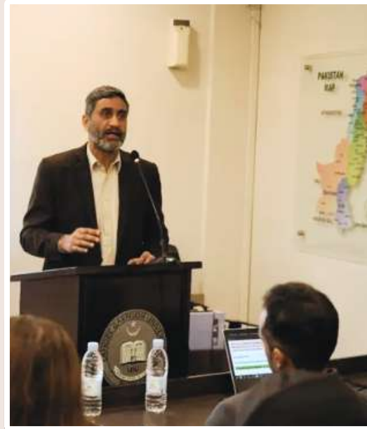
Brig (Retd.) Tahir Mahmood

The Department of Arts & Humanities hosted a guest lecture by Brigadier (Retd.) Tahir Mahmood on "U.S. Security Goals in the Global War on Terror and Its Impact on Democracy in Pakistan." The discussion focused on U.S. security objectives post-9/11, Pakistan's strategic significance, and the effects on U.S.–Pakistan relations and democracy, highlighting governance challenges, civil-military relations, and democratic consolidation.